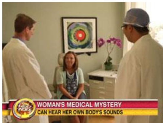
Women's Medical Mystery Leads to Life-Changing Surgery