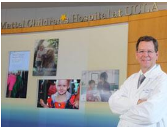
Pediatric Neurosurgeon Appointed to Endowed Chair for Epilepsy Research