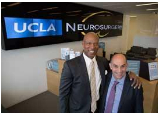
Lakers Legend & Business Leader Share Insights with UCLA Neurosurgeons