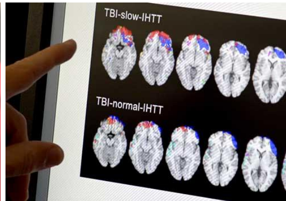
UCLA Leads Study of Epilepsy After Traumatic Brain Injuries