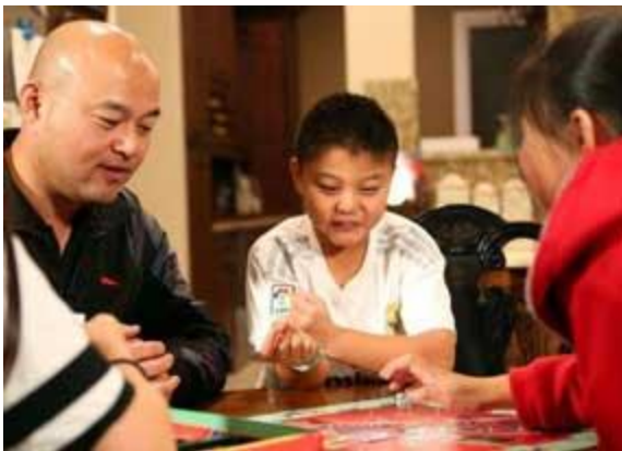
Minimally Invasive Procedure Cures Boy with Rare Seizures