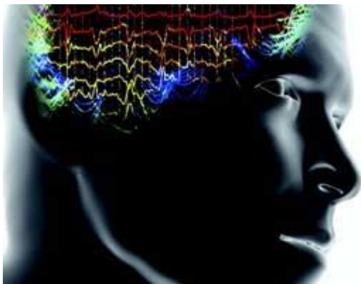
UCLA leads $21 million, grant-funded study of epilepsy after brain injuries