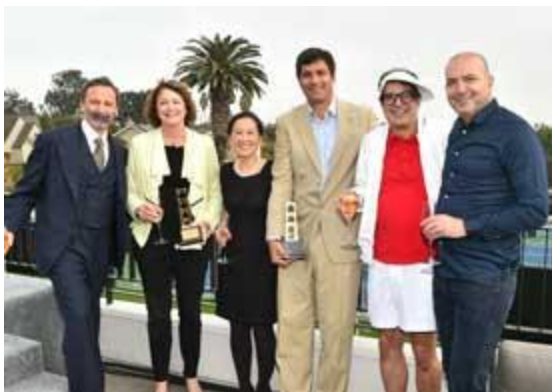
Hollywood Filmmakers, Tech Innovators Gather for Golden Portal Fundraiser